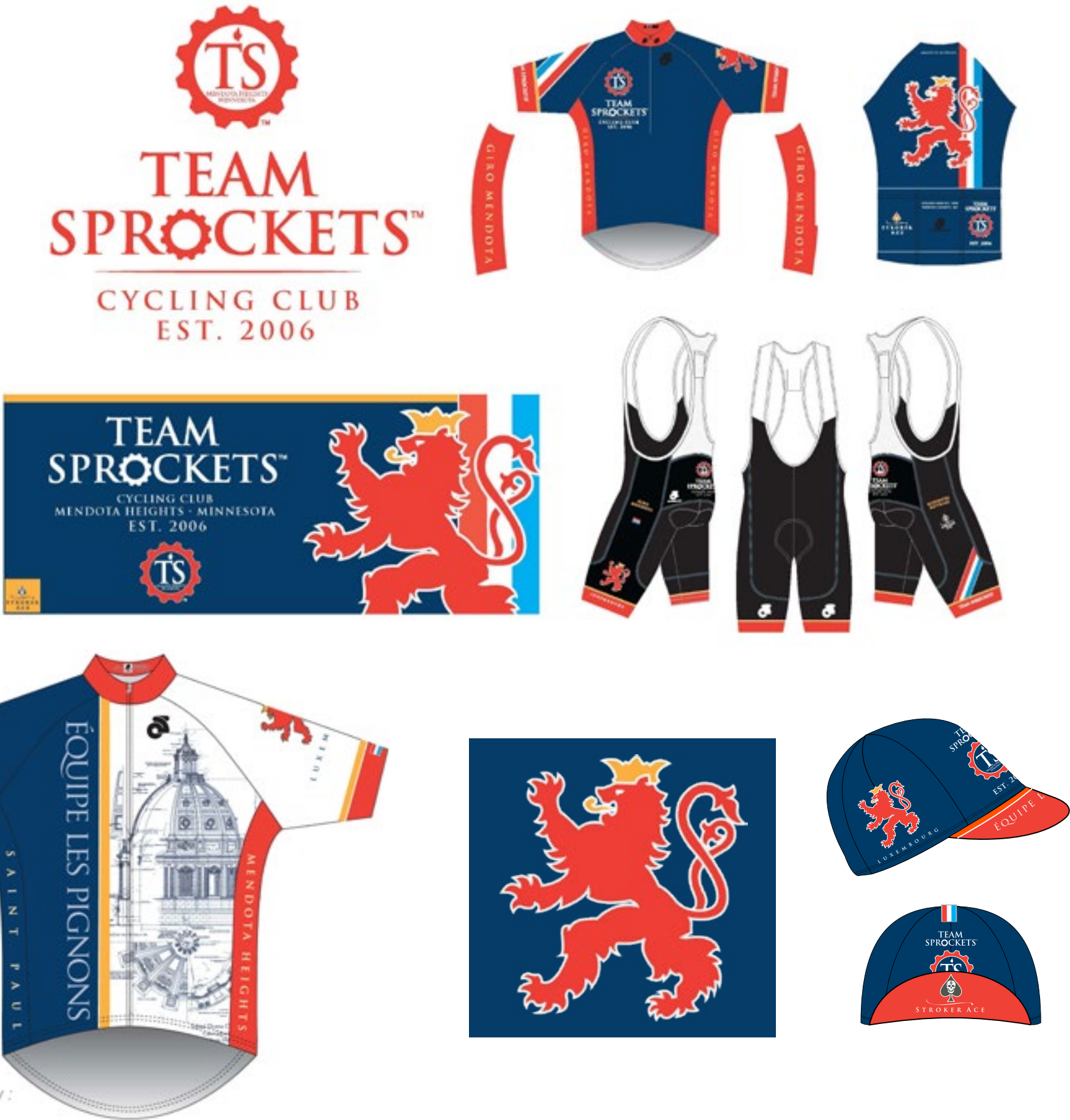
Front View :

Branding identity for a Twin Cities based bicycle club is based on classic European styling with a heavy influence from the cycling traditions, colors, and culture of the country of Luxembourg, and club founder’s family heritage. Includes graphic, communications and apparel design.