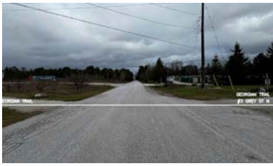
EXISTING CONDITION – GREY ST.