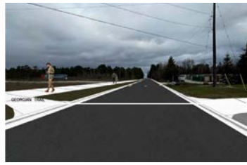
PROPOSED CONDITION – GREY ST.