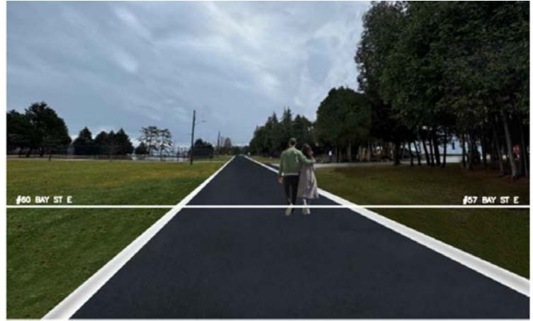
PROPOSED CONDITION – 57 BAY ST. E.