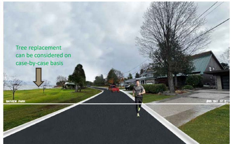
PROPOSED CONDITION – 85 BAY ST. E.

In July 2024, Council voted to direct staff to proceed with: