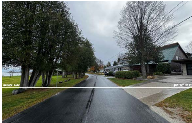
EXISTING CONDITION – 85 BAY ST. E.