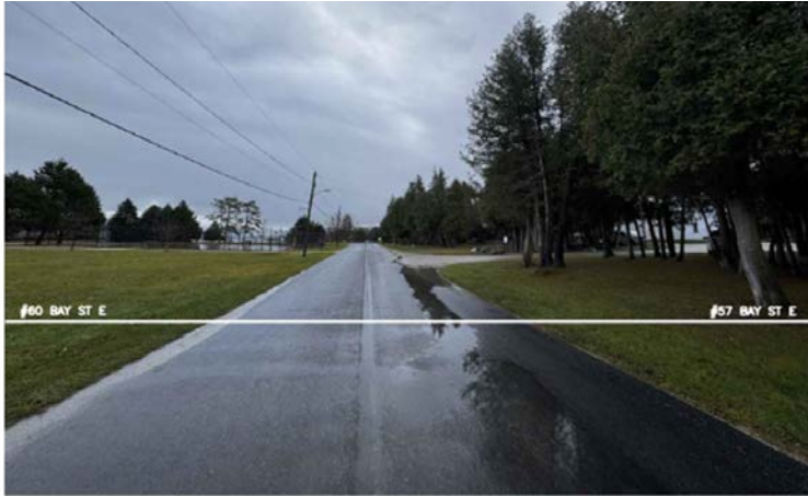
EXISTING CONDITION – 57 BAY ST. E.

One way from Mill St. to Grey St. with 6 m wide roadway (similar to current)