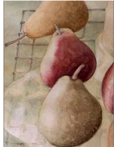
Close up for "Six Pears" Rebecca Moran. Watercolor

The next six sessions of Watercolor II will find us continuing to study master watercolor artists. We will learn about successful watercolor techniques and compositions applied to our own paintings. With spring flowers coming in to full bloom it is the perfect opportunity to feature them as subjects for painting.