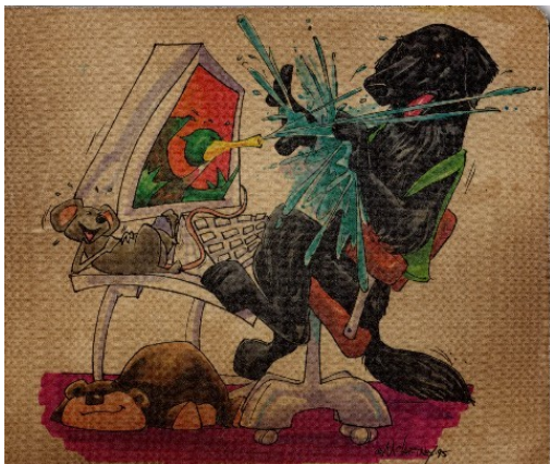
My Life is perfect....as long as I'm in it.