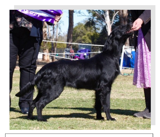
Joy Greggs; Best Minor Puppy in Show & Best Bred by Exhibitor in show Blackregal Keeper of The Flame