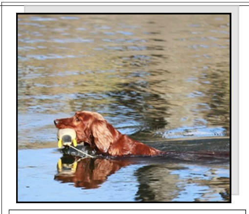
Ruby the Irish Setter Retrieving from the water

Retrieving trials always give an opportunity for ourselves and our dogs to meet new friends, catch up with some old friends and indulge in an activity that has reinforced the bond between a handler and their dog for decades.