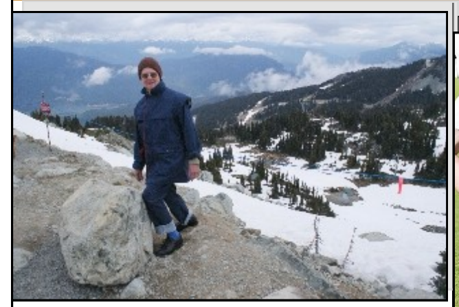
My Life is perfect....as long as I'm in it.

Just a comment on litters of puppies, at certain times of the year (less in winter) the club gets several puppy inquiries a week. If breeders have informed me or I hear on the grape-vine that there is a litter pending I have no way of passing on those inquiries to the breeders. Therefore I refer the inquirer to <a href="https://www.dogzonline.com.au">https://www.dogzonline.com.au</a> but I note on this site there is sometimes no advice as to projected dates of litters with 2 current exceptions. Unless you want to keep the litter a secret let me know and I will pass on the inquirer.