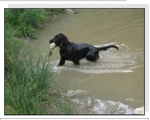
The Kindergarten! Some weeks old pup 'Salt' retrieving from the water like the big dogs.

Although we scored two third places in the advanced competition against formidable teams, with our Irish Setter "Ruby" it is the social atmosphere of these events that continues to attract us to Working Gundog Trials.