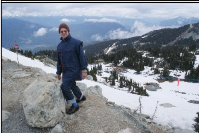
My Life is perfect....as long as I'm in it.