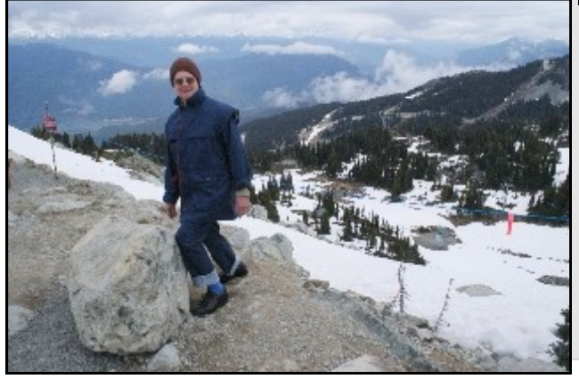
My Life is perfect....as long as I'm in it.

Welcome to another year in the life of Flat Coats. It's been a challenging Summer with much of the country experiencing drought, fires, rain and floods. It's easy to look on and feel helpless – especially when friends have lost everything but thankfully not their dogs.