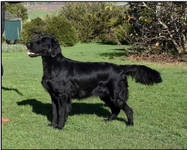
CH KELLICK LIMITED EDITION AT FIREBUSH (PADDY)