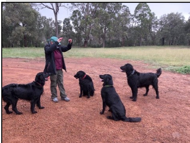
A Flat Coated Retriever Play date on the river in Bridgetown Western Australia, thanks to Jan Burgess for the photos. From left to right the dogs are: Isabel (Blackregal), Jazz (Skyehaven), Gus (Kellick) - and Pip (Hawksdale). (A mixture of 4 breeding kennels)