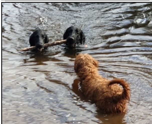
Anyone for a swim? Or maybe a stick ball. The dogs meet every Monday.