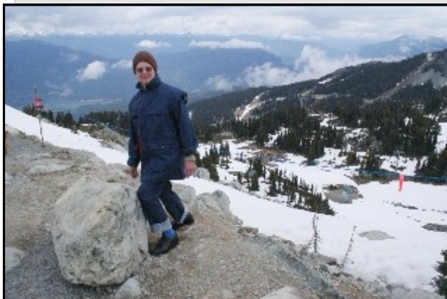
My Life is perfect....as long as I'm in it.