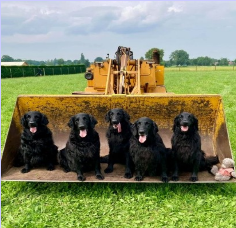
Above 5 Flat Coated Retrievers from Scandinavia.