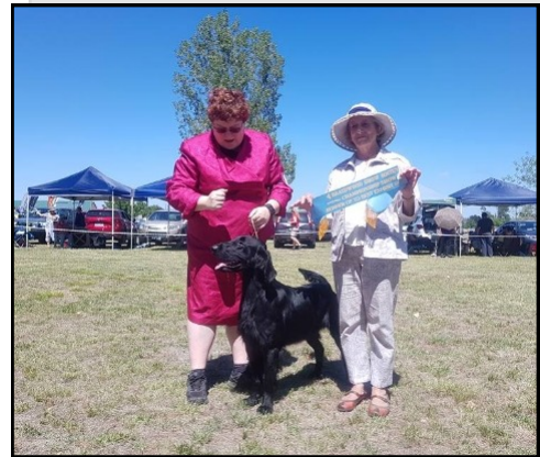
Awesome day at Braidwood Show. Ry-der took out Runner Up to Best in Group! Good boy. Lovely day there this year too, unlike the rain last year.