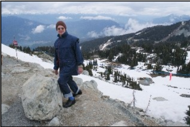
My Life is perfect....as long as I'm in it.