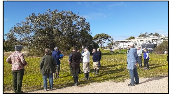
A group of Novice competitors getting briefed by the judge in what he wanted to see in the dogs .