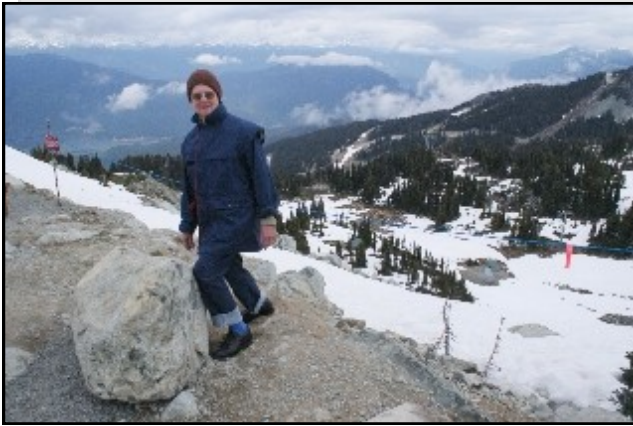
My Life is perfect....as long as I'm in it.

With Covid and hopefully the restrictions associated are over and we can get on with our normal life.