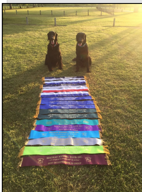
The spoils of recent shows.