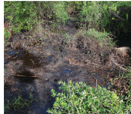
Wallows are often used in shady sites