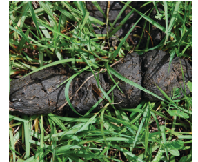
Swine feces vary in size and color depending on local diet