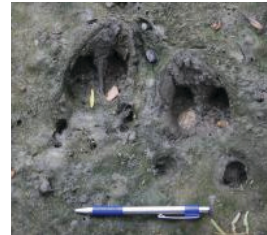
Swine tracks can be identified