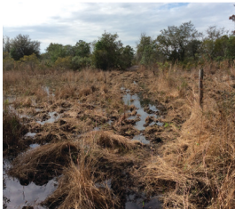
Rooting is common along edges of wetlands