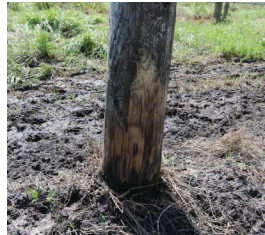
Rubs on posts and trees are likely used as scent marks