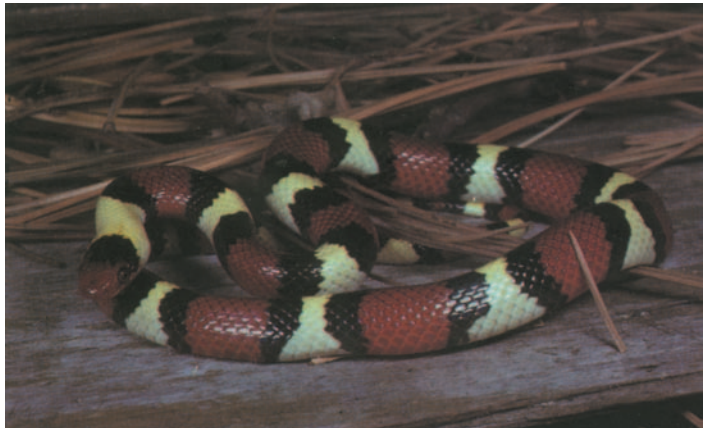
Although the scarlet kingsnake (l) ( Lampropeltis triangulum elapsoides ) and northern scarlet snake (r) ( Cemophora coccinea copei ) resemble the venomous coral snake, they are harmless. In contrast, the coral snake has a black snout, not red. Its red bands are bordered by yellow, not black.