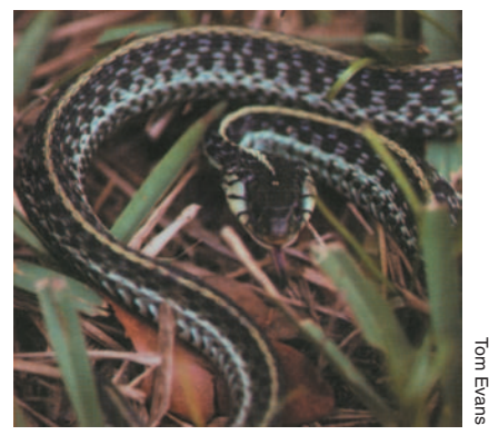
GARTER SNAKE (Thamnophis sirtalis)