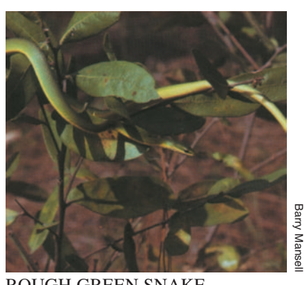
ROUGH GREEN SNAKE (Opheodrys aestivus)