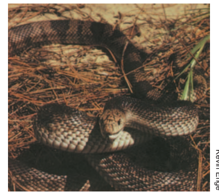
FLORIDA PINE SNAKE (Pituophis melanoleucus mugitus)