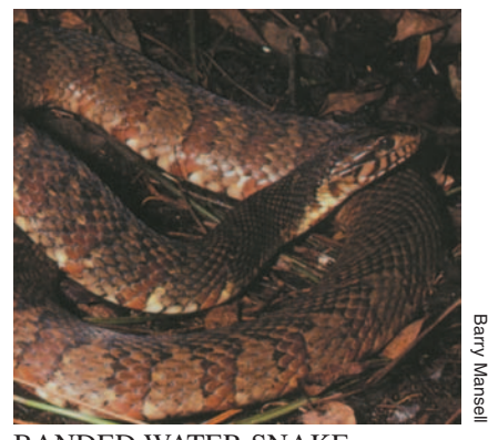
BANDED WATER SNAKE (Nerodia fasciata fasciata)