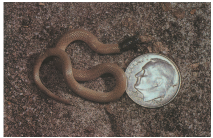
FLORIDA CROWNED SNAKE (Tantilla relicta)

There is no good reason to kill a snake except in the unlikely situation of a venomous snake posing immediate danger to people or pets. Snakes usually bite people only if they are molested; it's their only means of self-defense. Even a venomous snake in the woods or crossing the road poses no threat and should be left alone. Also, most larger snakes travel in large areas, so one you see in your yard today may be far away tomorrow.