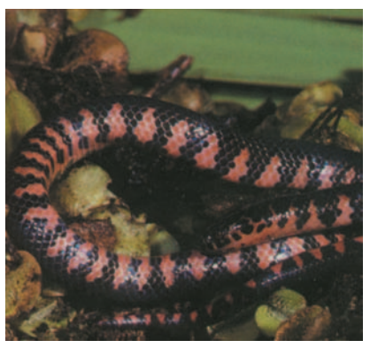
EASTERN MUD SNAKE (Farancia abacura abacura)