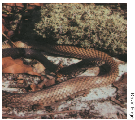
EASTERN COACHWHIP (Masticophis flagellum flagellum)