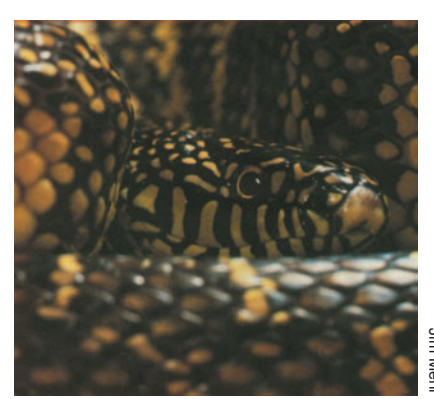
FLORIDA KINGSNAKE (Lampropeltis getula floridana)