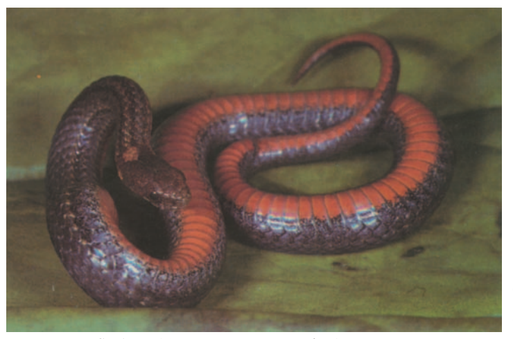
REDBELLY SNAKE (Storeria occipitomaculata)

Other small but abundant Florida snakes include the Florida brown, Florida redbelly, smooth earth, rough earth, pine woods and Florida crowned snakes.