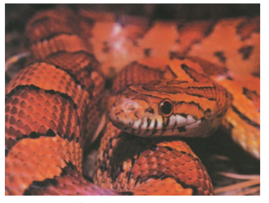
RED RAT or CORN SNAKE (Elaphe guttata)