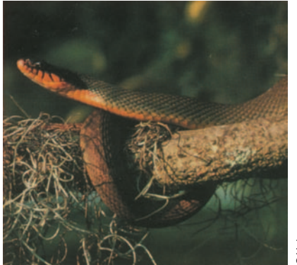
REDBELLY WATER SNAKE (Nerodia erythrogaster erythrogaster)