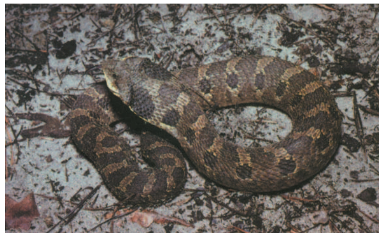
EASTERN HOGNOSE SNAKE (Heterodon platirhinos) in defensive posture.

Water snakes are distinguished from venomous cottonmouths by their behavior and their "face." Cottonmouths tend to stay put when encountered, often coiled and, if sufficiently harassed, will give the open-mouth display that gives them their name. Harmless water snakes.