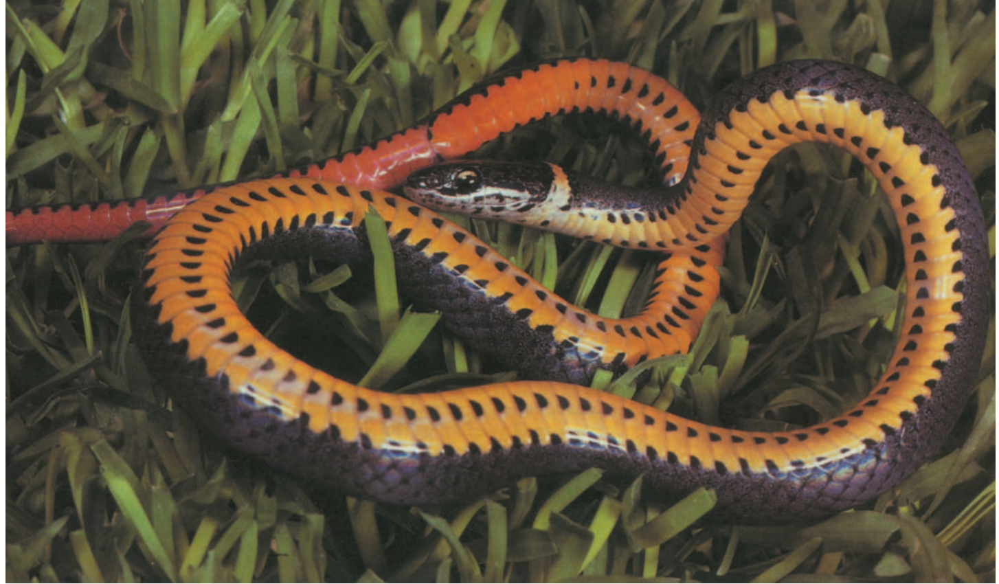
SOUTHERN RINGNECK SNAKE (Diadophis punctatus punctatus)