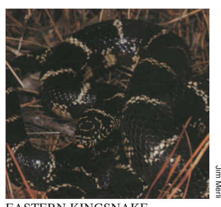
EASTERN KINGSNAKE (Lampropeltis getula getula)