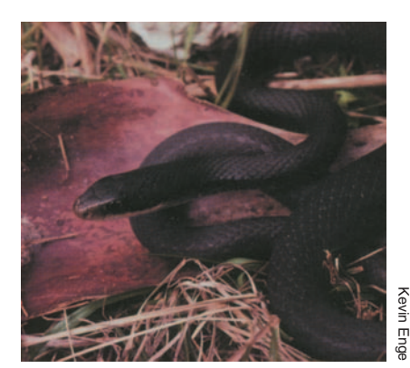
SOUTHERN BLACK RACER (Coluber constrictor priapus)