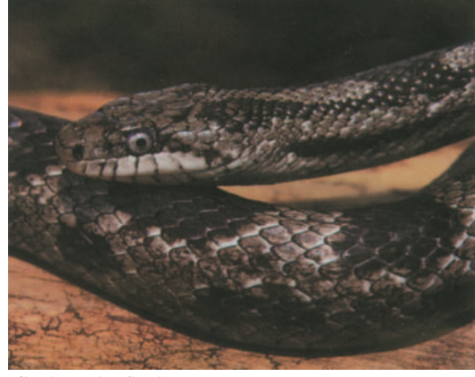
YELLOW RAT SNAKE (Elaphe obsoleta quadrivittata)