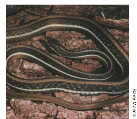
RIBBON SNAKE (Thamnophis sauritus)