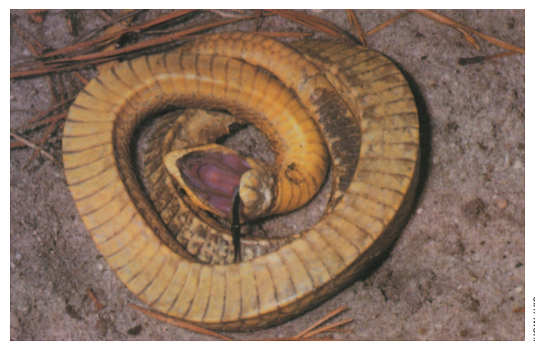
EASTERN HOGNOSE SNAKE playing dead.

which commonly bask stretched out on tree branches over water, are more likely to seek immediate escape into the water when encountered. Also, cottonmouths usually swim with their entire body on top of the water, whereas water snakes are more likely to escape underwater or swim with only their head at the surface.