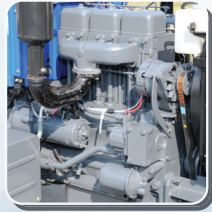
POWERFUL EFFICIENT ENGINE

Swaraj tractor, the first choice of the farmers. A powerful engine with 1800 rated r/min, makes every job easy and increases the life of the tractor. Unparalleled features and attractive design make Swaraj Tractor, an invaluable asset for its farmer.