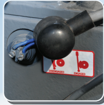
NEUTRAL SAFETY SWITCH