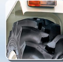
345.44 X 711.20 mm (13.60 X 28) REAR TYRE