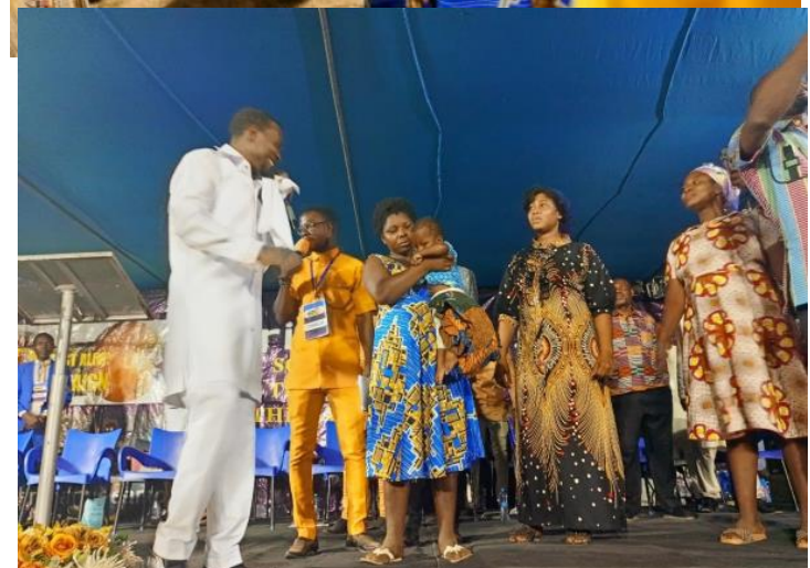
MOTHER AND SON AFTER THE HEALING...