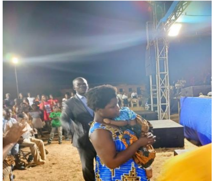
MOTHER AND SON BORN BLIND WITH CLOSED EYES