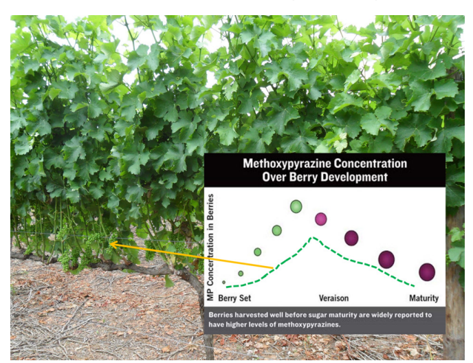
Figure 2. Illustration of early leaf and lateral removal at pea size in the fruit zone (Sauvignon blanc). Increasing sunlight at the bunch level allows to reduce IBMP berry skin concentration pre and post veraison (inspired by the work of Roujon de Boubee D.).