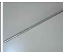
extension pipe 50cm V18-50