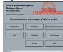
PC Software DMI-Controller