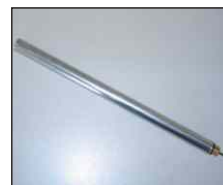
extension pipe 30cm V18-30