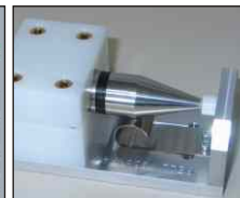
test module PE22