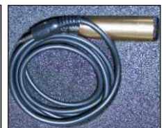
flexible extension cable V18-flex