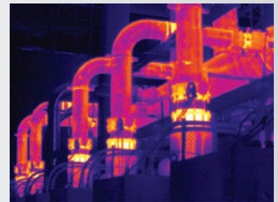
MultiSharp Focus, available on the Ti450.