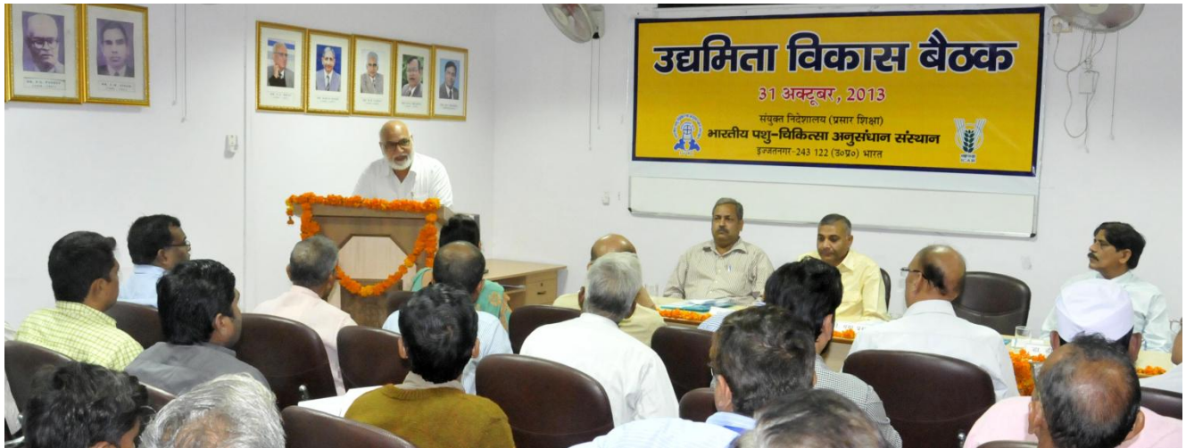
Entrepreneurship meet organised at IVRI for the progressive farmers & entrepreneurs of Uttar Pradesh & Uttarakhand (2013)

The entrepreneurial farmers are being felicitated and honoured by agricultural universities and research institutions and agricultural development agencies on different occasions like farmers' fairs ( http://www.icar.org.in/en/node/10275 ). Almost all the SAUs, ICAR institutes and KVKs in India have list of enterprising farmers whom these institutions not only have awarded but a few of them utilize their services as resources persons too. The ICAR honours innovative farmers including agripreneurs under different categories every year on its Foundation Day on July 16. The farm magazines, radio, TV and YouTube videos profiling enterprising farmers have become very common in recent times ( https://www.youtube.com/watch?v=7MmdNNfON0Y&spfreload=5 ).