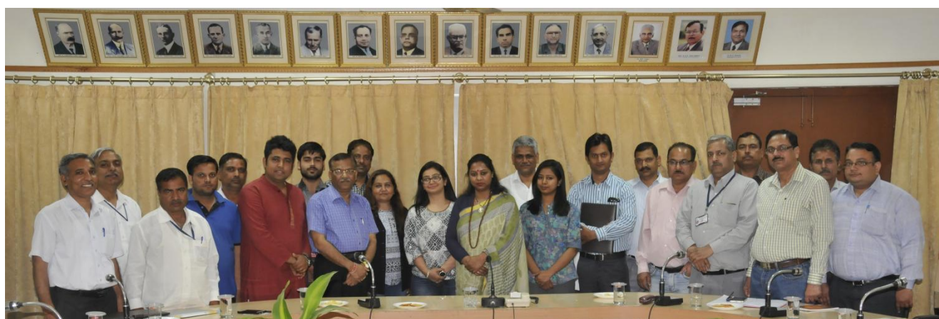
Agribusiness Incubation Centre Advisory Committee meeting at ICAR-IVRI, Izatnagar held on 11th April, 2016

Considering the growing role and importance of agripreneurship in changing agricultural scenario, the Global Forum for Rural Advisory services (GFRAS) has chosen the topic, "The Role of Rural Advisory Services for Inclusive Agripreneurship" for its 7 th Annual Meeting, Cameroon during 3-6 October 2016. This meeting will be an opportunity to discuss, learn, exchange, and formulate recommendations on the roles and required capacities of RAS for supporting inclusive agripreneurship as important element of sustainable rural development ( http://www.g-fras.org/en/annual-meeting-2016.html ).