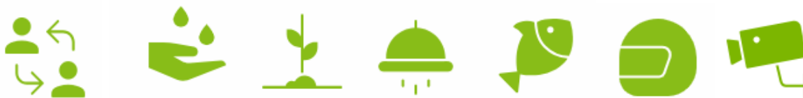
Seven areas of interventions that sustain United Nations Peace, security and development

L'IPHD-International Promoting Human Development « IFME-Internationale Foerderung Menschlicher Entwicklung » est une organisation internationale non gouvernementale qui utilise sept domaines d'intervention pour promouvoir le développement humain en apportant des solutions aux alertes rouges des Nations Unies en soutenant les 17 objectifs de développement durable des Nations Unies dans le monde. Nous agissons comme un laboratoire virtuel et physique d'idées, en incubant des initiatives qui contribuent aux objectifs de développement durable des Nations Unies et à l'Agenda 2030. L'objectif global est de soutenir/développer ou créer des projets issus du développement de l'humain. La PIDH « IFME » est une organisation internationale non gouvernementale pour les professionnels et apprentis dans divers domaines. L'être humain est au centre de son activité. Ses activités sont réparties en sept domaines d'interventions . La mission de « FME » est de contribuer pour le développement/ la croissance de l'homme à travers la sensibilisation de nos sept domaines d'interventions. L'objectif général est de soutenir/ développer ou créer des projets allant dans le sens de développement de l'homme. La PIDH à les professionnels et apprentis dans les différents domaines mentionnés.