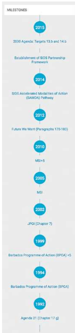
Figure 1: 1992 to 2015 Milestones

Most recently, in September 2014, the Third International Conference on SIDS was held in Samoa. The SIDS Accelerated Modalities of Action Pathway (SAMOA Pathway) was adopted at the conference. It addresses priority areas for SIDS and calls for urgent actions and support for SIDS' efforts to achieve sustainable development.