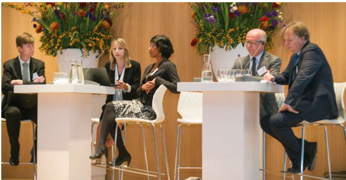
Working Group 12. Risk Assessment and Risk Management

Bridging the gap between climate scientists and (advisors to) policy makers could be achieved by training or assisting researchers in presenting findings in a manner that is understandable and useable for policy makers. Another option would be the training of (advisors to) policy makers so that their capabilities to understand, interpret and use scientific findings.