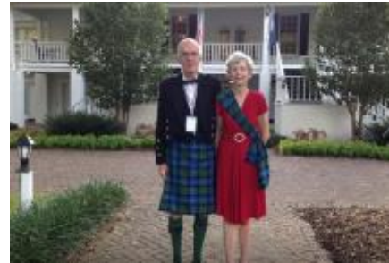
Sights from the Saturday night silent auction, open bar and annual dinner at Litchfield Country Club.