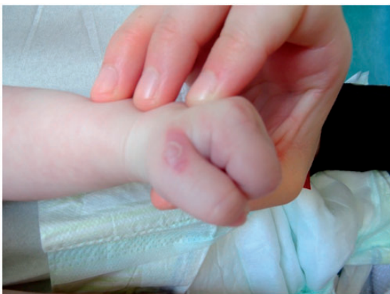
Fig. 1. Skin involvement typical of IP: rash with warty inflammatory lesions on the lines of Blaschko.

At the age of four months, the patient suffered a severe collapse during general anesthesia for photocoagulation of an IP retinal vasculopathy. Echocardiography performed after resuscitation showed severe pulmonary hypertension