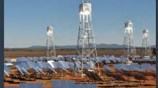
3MW Solar Thermal Plant, Lake Cargelligo NSW