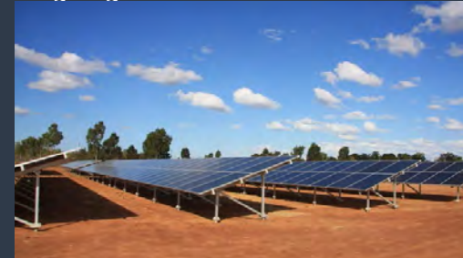
256kW Ergon, Doomadgee QLD