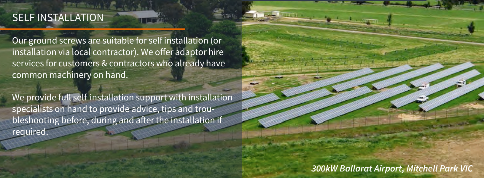
300kW Ballarat Airport, Mitchell Park VIC

We provide full self-installation support with installation specialists on hand to provide advice, tips and troubleshooting before, during and after the installation if required.