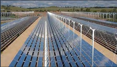
9.5MW Liddell Solar Thermal Power Station, Singleton NSW