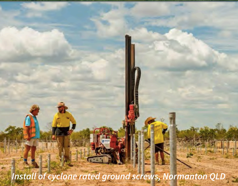
Install of cyclone rated ground screws, Normanton QLD

We have developed a range of specialty installation equipment allowing us to offer huge installation capabilities to our large commercial & mining clients (in all soil conditions, including rock). For larger projects we mobilise Australia wide but also have a number of accredited installation partners across the country to cater for smaller projects.