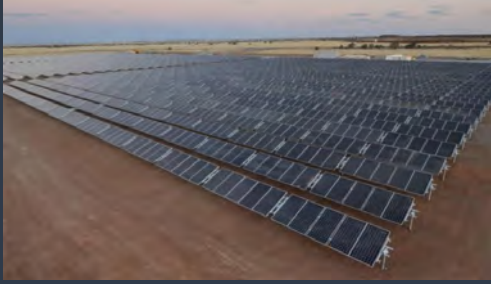
3MW Cannington Mine Solar Farm, McKinlay QLD