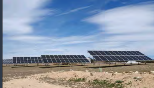
44kW Residential, Krawarree NSW