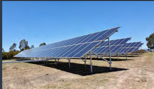
220KW Mount Stromlo Water Treatment Plant, Stromlo ACT