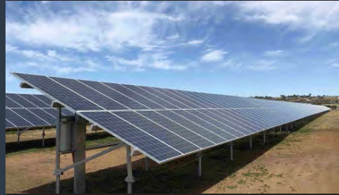
1.356MW MC Herd, Geelong VIC