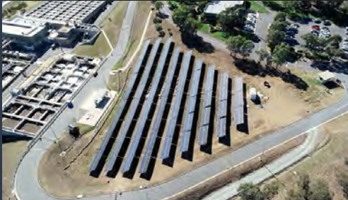
390kW Lower Molonglo Water Quality Control Centre ACT