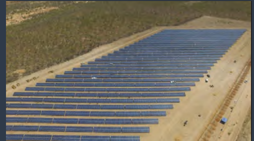
5MW cyclone rated solar farm, Normanton QLD

All Ground Screw Australia products are certified by Australian structural engineers, manufactured from grade C350 steel with continuous welded helix and hot-dip galvanized according to ISO 1461.