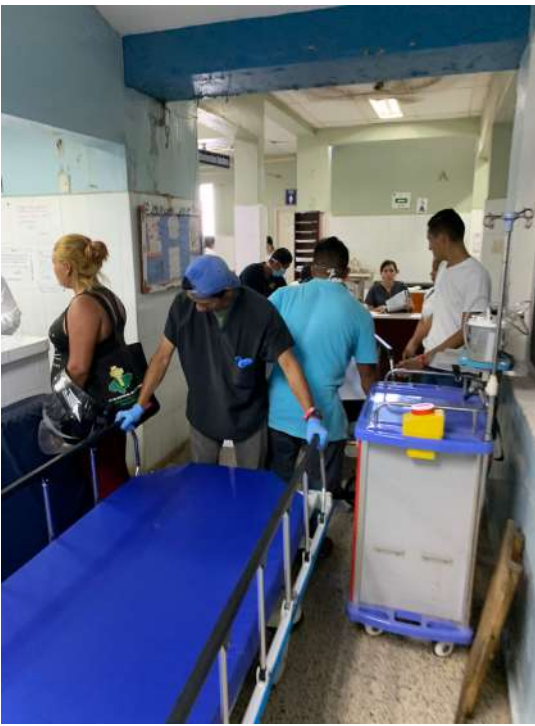
Stretchers come in ...