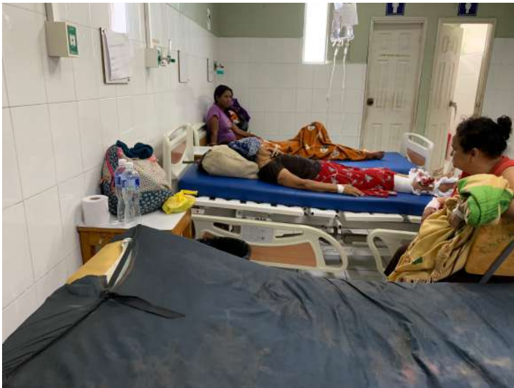
The old mattresses go out ...