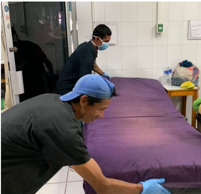
Replacement mattresses are put to good use in the emergency room and maternity!