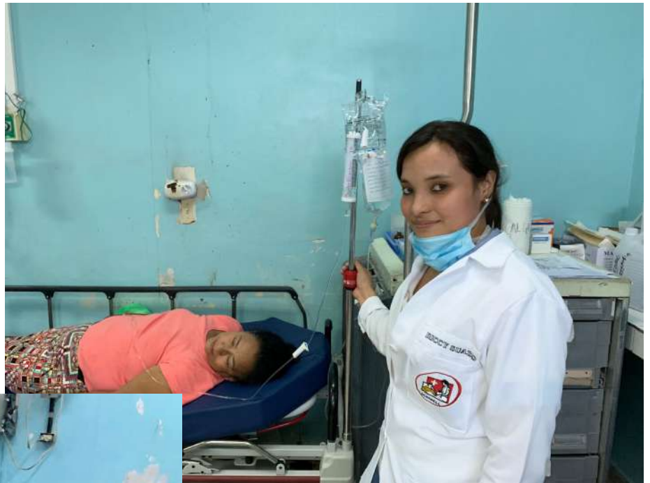
Minutes later, patients are on the stretchers!