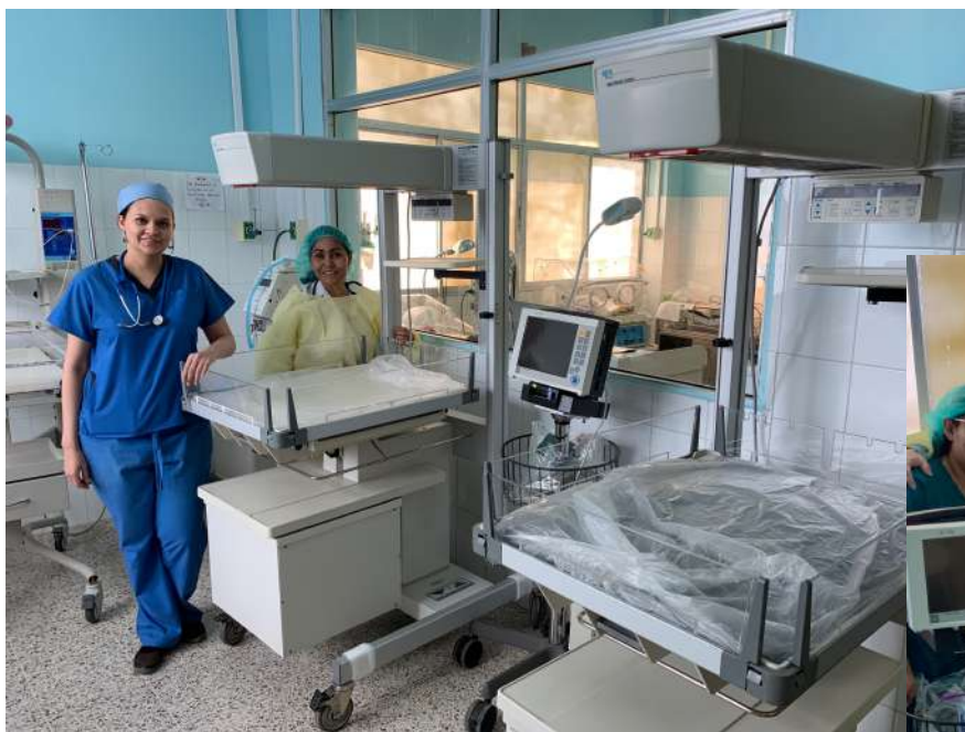
Ready to receive babies ... Lots and lots of babies!