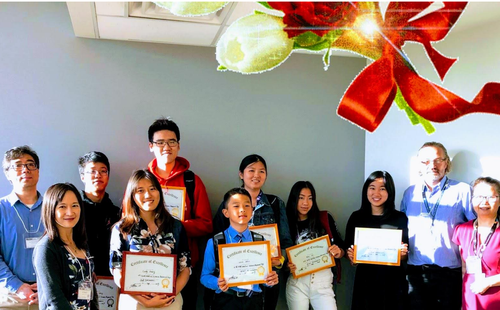
2019 4 th SLAP Research Day Winners