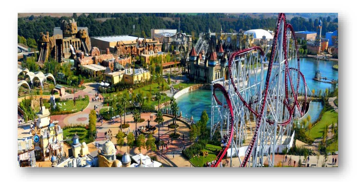
Day 4: (30 June) Full day at Zoo-Marine (tickets and 2-way transportation)

Take the bus and spend a full day at an amusement park: Rainbow Magic Land.