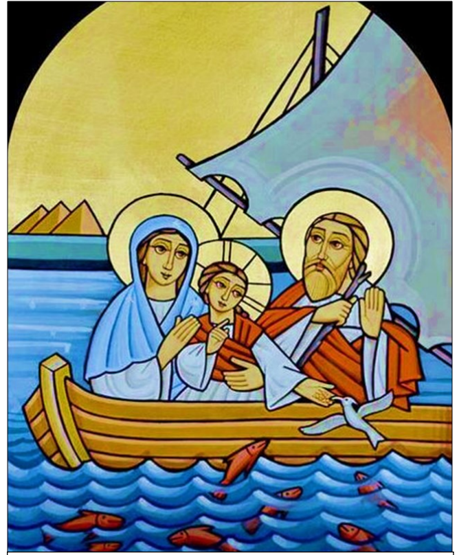
"Blessed be Egypt, My people" (Isaiah 19:25)