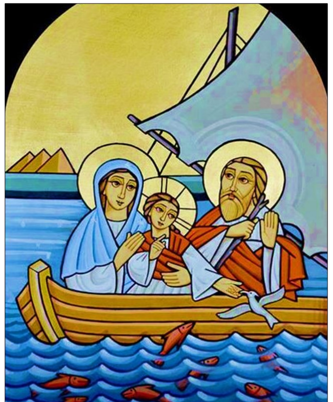
"Blessed be Egypt, My people" (Isaiah 19:25)