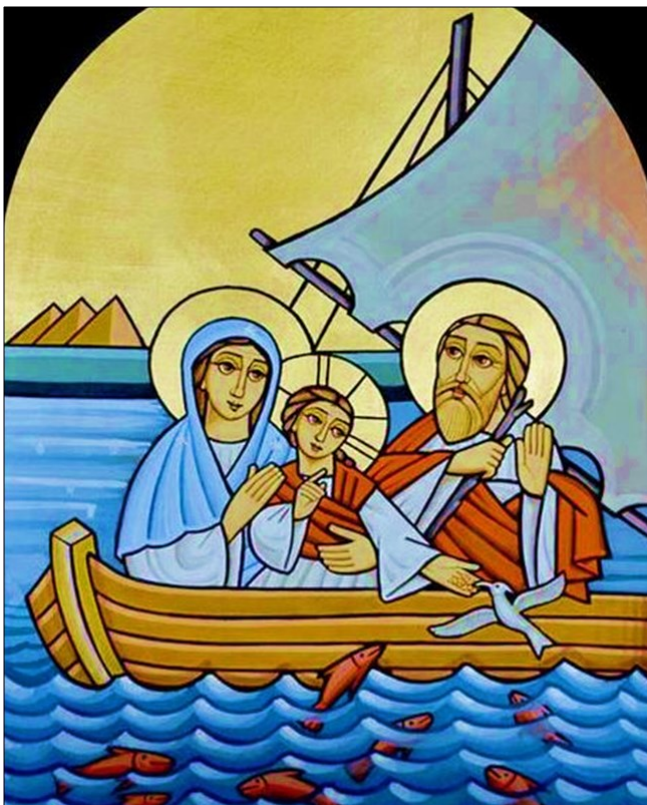
"Blessed be Egypt, My people" (Isaiah 19:25)