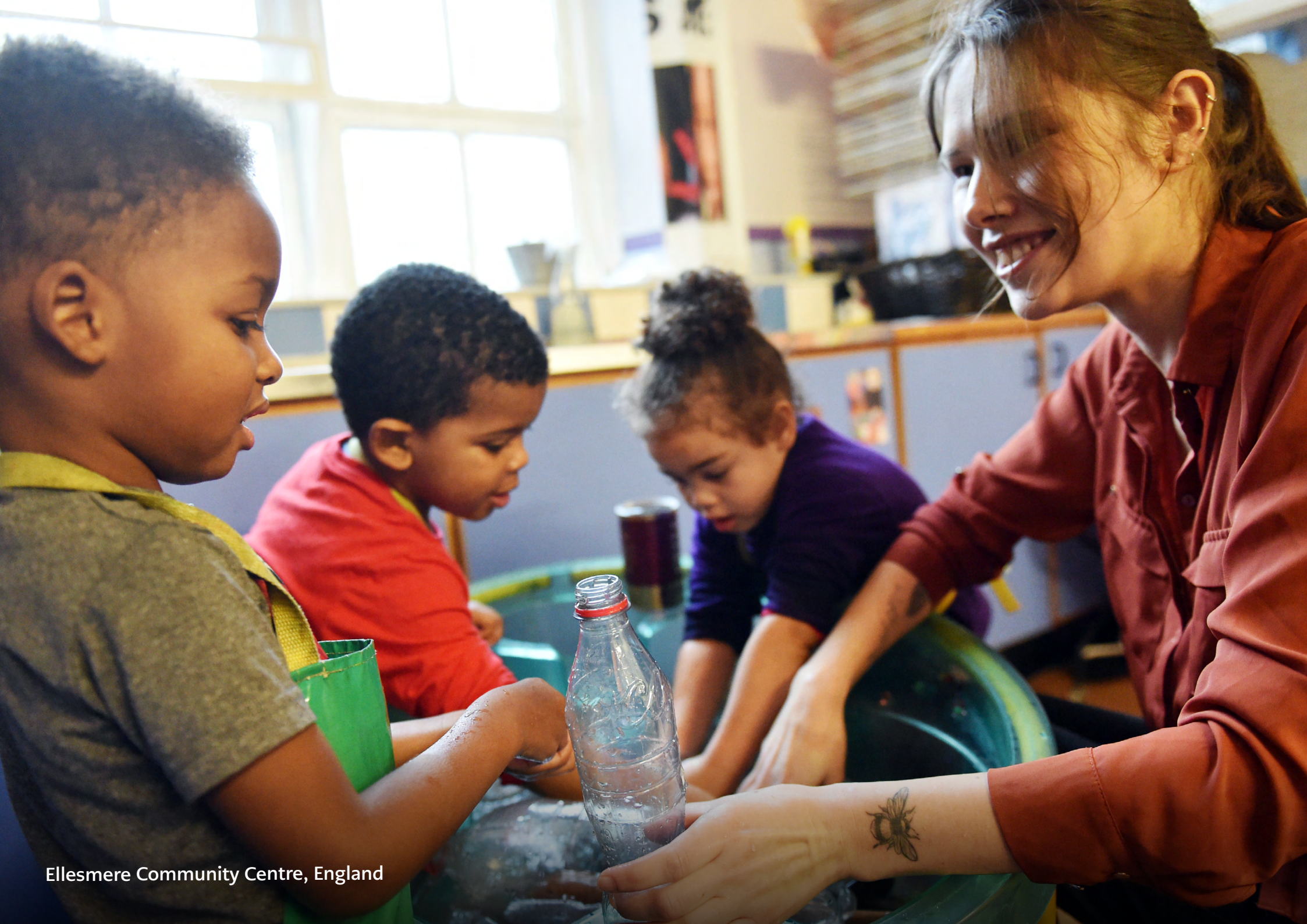
Ellesmere Community Centre, England