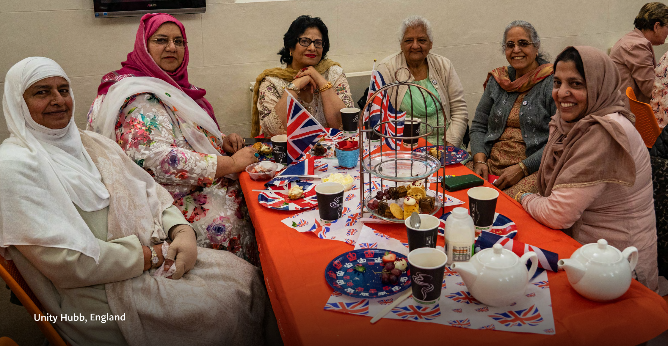
Unity Hubb, England