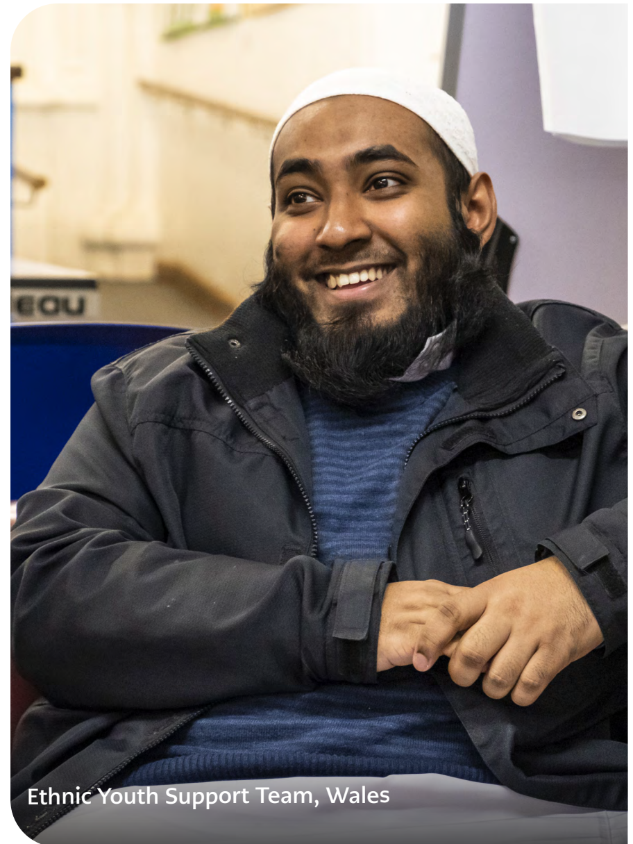
Ethnic Youth Support Team, Wales

KPI 8 - Overall customer satisfaction will be over 80% .