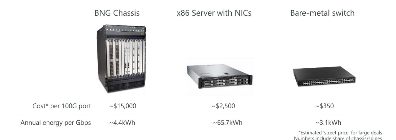
Low-cost bare-metal hardware

And alongside the hardware, companies like RtBrick are offering routing software that transforms those bare-metal-switches into fully functioning IP/MPLS infrastructure. Disaggregated systems can replace traditional PE Routers or BNGs (Broadband Network Gateways), for example, at a fraction of the cost. It's a huge prize!