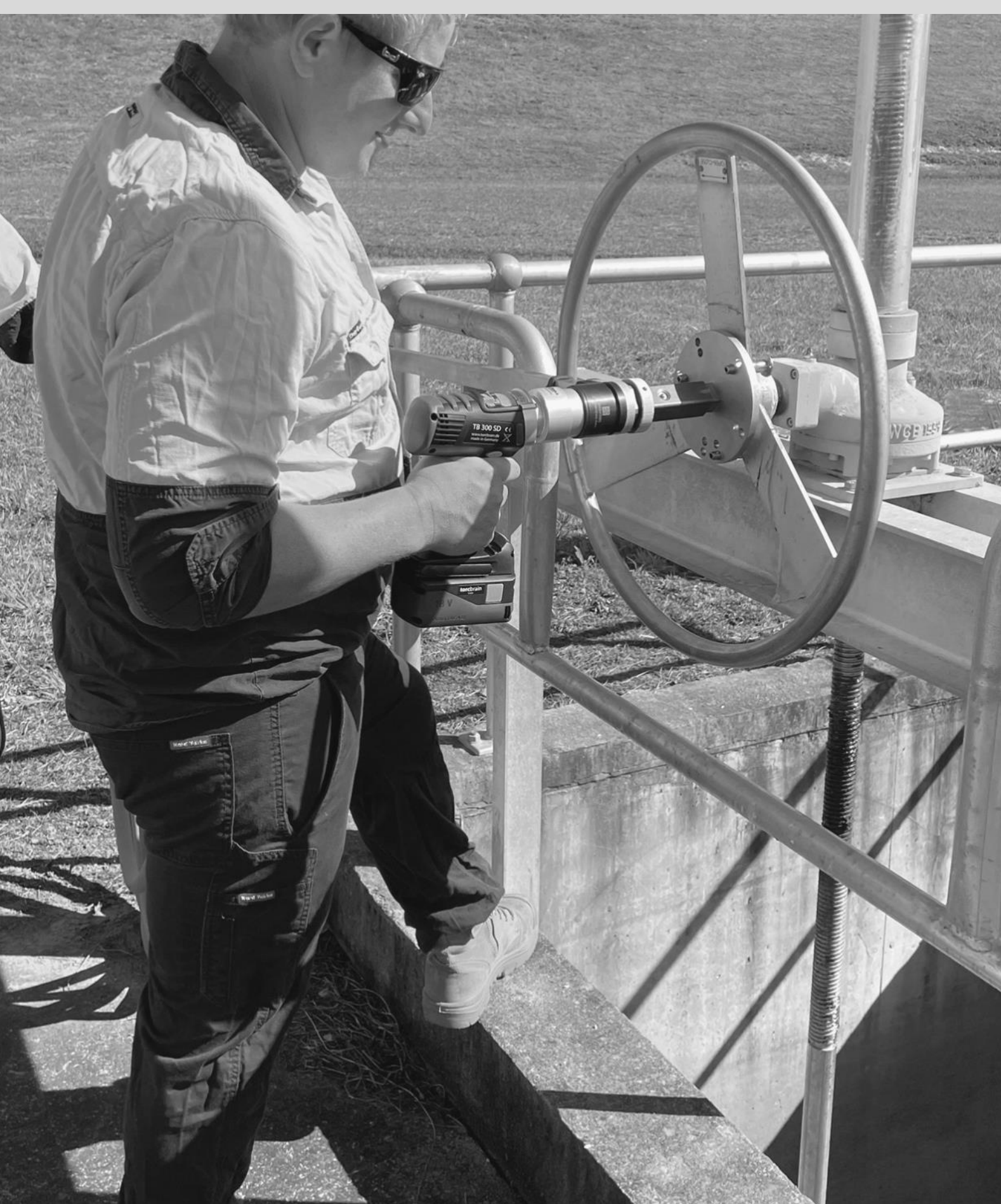
Cordless Portable Valve Actuator System