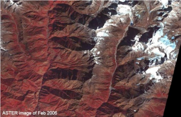
Snow cover in the Himalayas - 2006