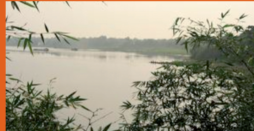
View of Lake Tumba