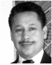
Senator Sanaullah Baloch Balochistan Institute for Development, Pakistan