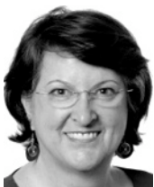
Catherine Bearder, MEP Member, Committee on International Trade, European Parliament

Remote Sensing is one clear area where the EU can really try to pull its resources together. In total there are more than 10 satellites in the EU Member States, but it does not seem that they are being used for the issue of illegal trade of resources. From a very practical point of view, satellites can be fed into a much larger strategy. After 2013, when EU's Africa country strategy papers have to be reworked, are we going to see acknowledgement and implementation of these issues in such policies?