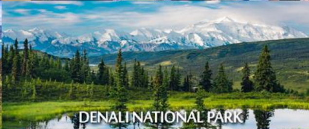
DENALI NATIONAL PARK