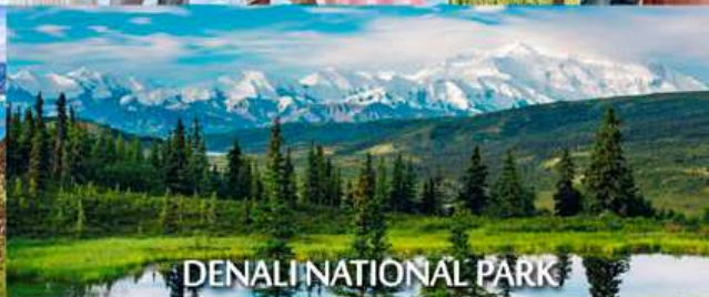
DENALI NATIONAL PARK