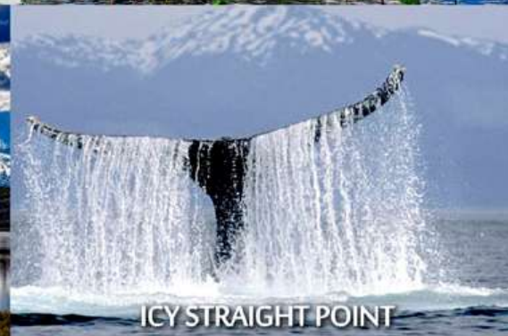
ICY STRAIGHT POINT