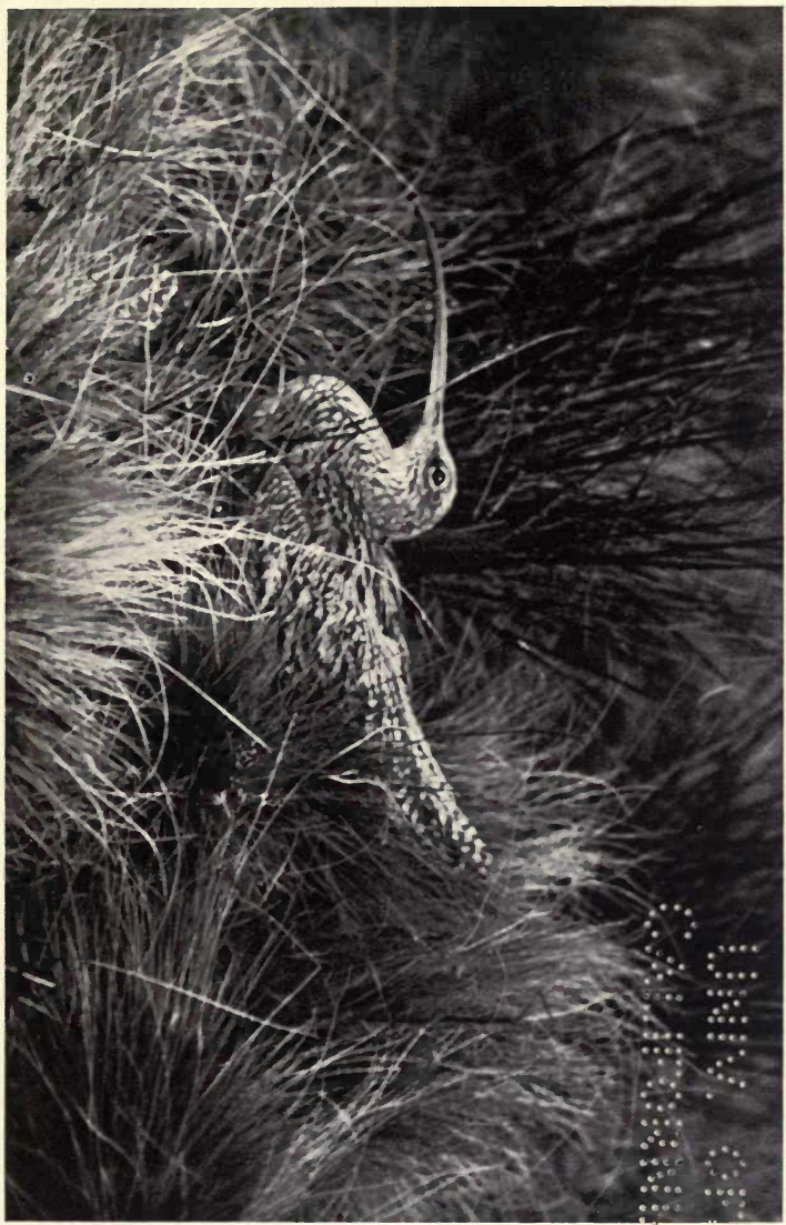
THE CURLEW ON THE MOOR.