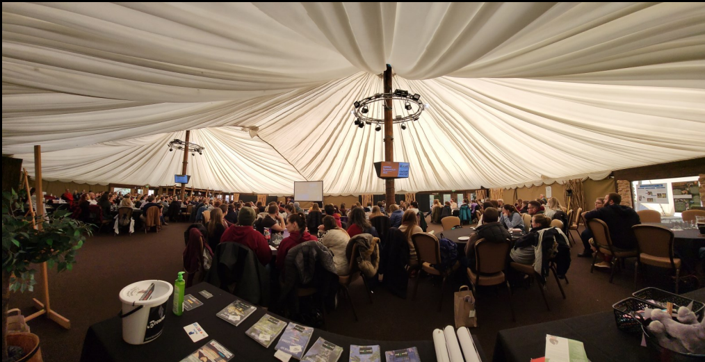
The ABWAK Annual Symposium was a very popular event with over 100 delegates attending.

We will never cease feeling emotional when people come up to us and tell us how much they enjoy our booklets and posters and how helpful they find them. We are so grateful for these lovely comments!