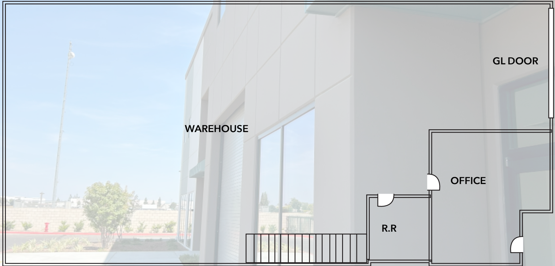
FLOOR PLAN (NOT DRAWN TO SCALE)