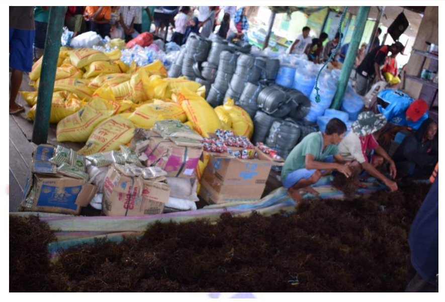
IGP Seaweeds materials and seedlings

We have 60 seaweed farmers, with 360 total number of family members from Simariki, Zamboanga City who were affected by the storm that struck in Zamboanga City last