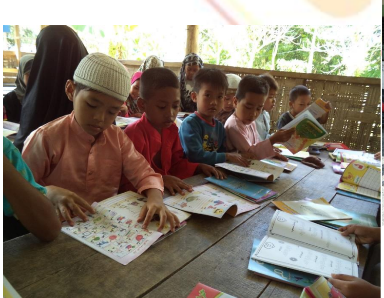
Students browsing and reading the books

Arabic language but have Tausug Translations for the students to understand. There were a total of 12,000 books distributed in the entire City as well as provinces nearby for 2,800 students. The total cost of this project was PHP 670,000.00.