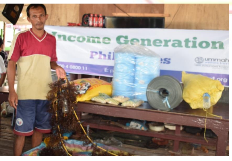
Seaweed farmer with the materials he received

2017. Some of the Seaweed plants were destroyed and damaged because of the natural calamity. With their situation, as they no longer have other means of work to do as they only depend on seaweed farming as one of their main source of livelihood. We reached them helped by giving those materials for planting seedlings. Each one of them received: Seaweed seedlings, plastic bottle, softie, binder, rice, coffee and sugar. The total cost of this project was PHP 360,000.00.