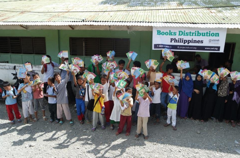
Happily raising the books