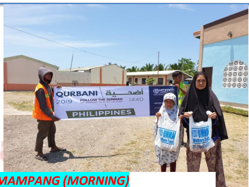
DAY 1: DISTRIBUTION IN MAMPANG (MORNING)