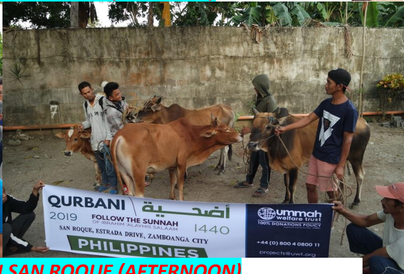
DAY 1: DISTRIBUTION IN SAN ROQUE (AFTERNOON)