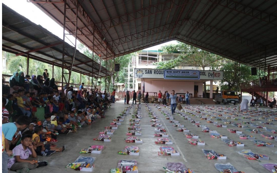
Gifts arranged by row

went home with a grateful heart and school supplies that will be used for their education. This project was funded by Goodwill 786 management and sponsors.