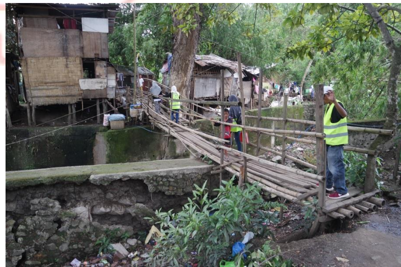
During Qurbani Survey