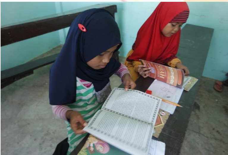
Students Reading books