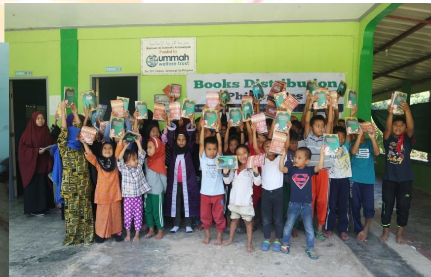
Children are very happy with their books