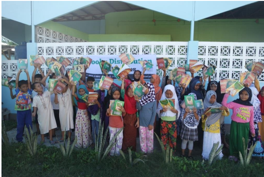
Students with their new books

to fully understand their lessons. There were a total of 13,000 books on different level written In Arabic but has a vernacular translation of Tausug that was distributed to 3,250 students. The total cost of this project was PHP 570,519.39.