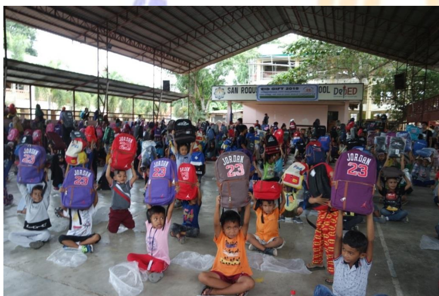
Children received their gifts