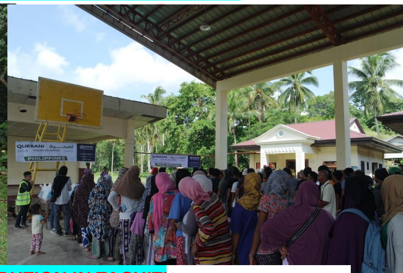
DAY 2: DISTRIBUTION IN TAGUTI