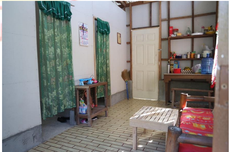
2 bedrooms and spacious area inside of the house