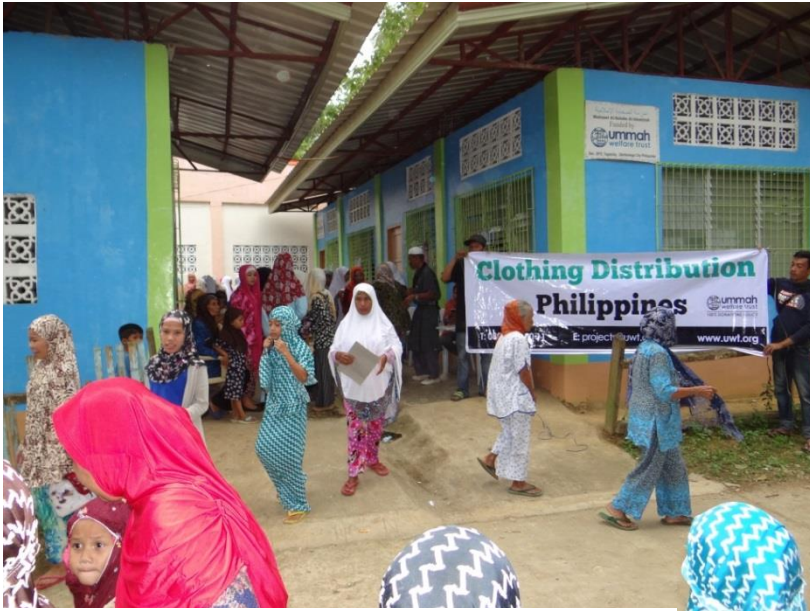
Female beneficiaries Signing the documents