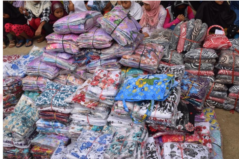
Clothes for female

There were 4 different places/ areas held during the distribution of clothes such as Barangays Tictapul, Tagasilay, Talabaan and San Roque in this city. The administration visited each place to personally monitor and assist during the distribution. For females; they received 1 hijab and abaya. For male; 1 Gamis. There were a total of 3,500 people given new clothes. The total cost of this project was PHP 3,590,000.00.