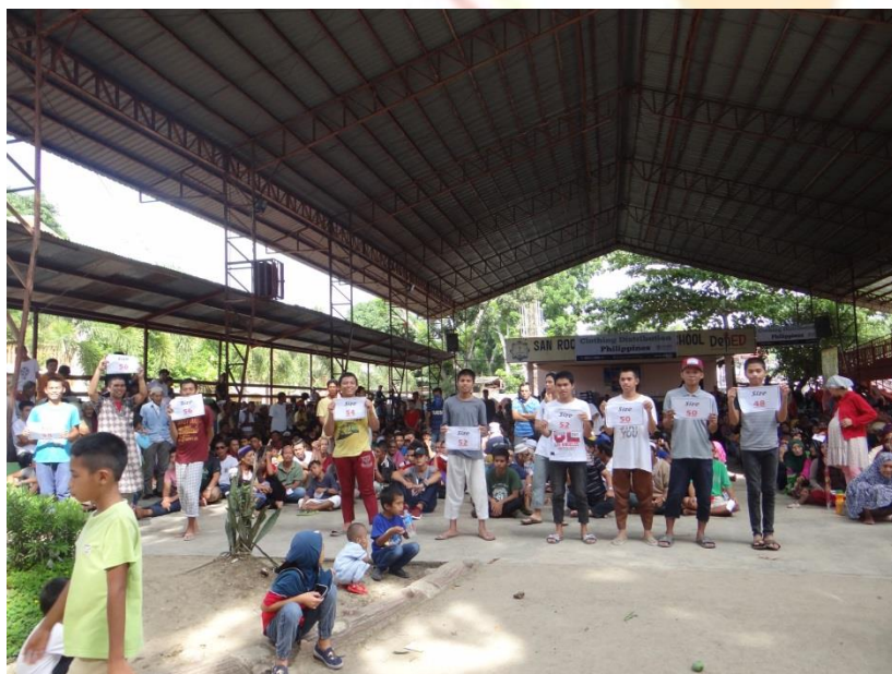
Beneficiaries gathered in the covered court