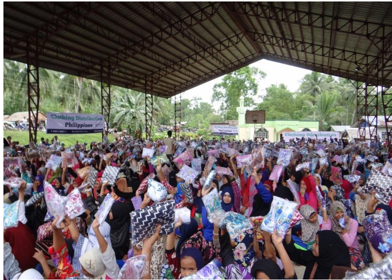
Female beneficiaries raising the clothes they received