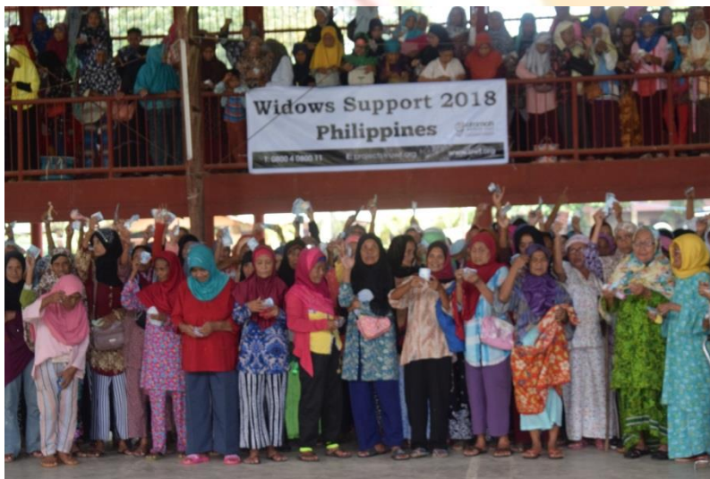
Widows received financial assistance