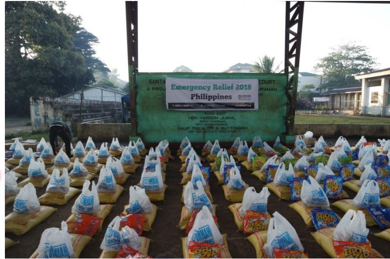
Packages arranged for distribution

1,800 families and 10,108 total numbers of people. The victims are in the pity situation and we reached help to them by giving them personal necessities and food package inclusions of: 1 sack of 25-kilo rice, 3 liters oil, 2.5-kilo laundry soap, 1 bag, 10 notebooks, 5 pencils, 5 ball pens, 1 sharpener, 1 eraser and Hijab with long skirt for young girls. The total cost of this project was PHP 3,521,974.00