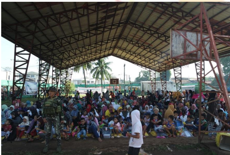
Fire Victims Families gathered in the covered court