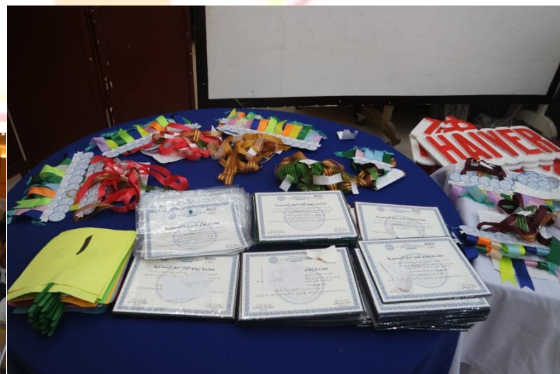
Certificates and Awards