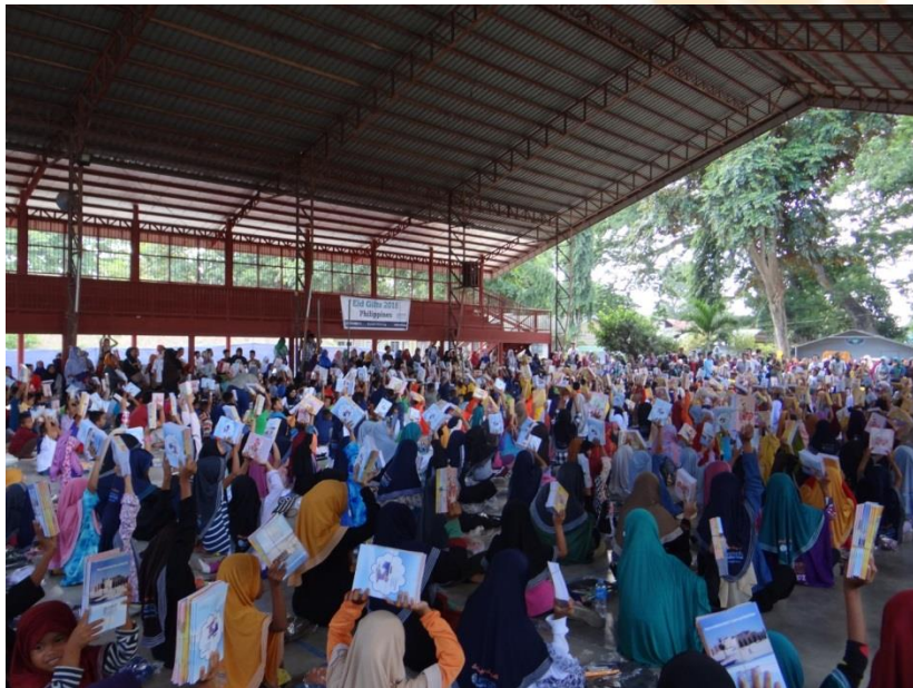
Children raising Islamic books and school supplies that they received

in their studies. This was a big help for them and for their parents who cannot afford to buy even one notebook for his/her child. The total cost of this project was Php 350,000.00.