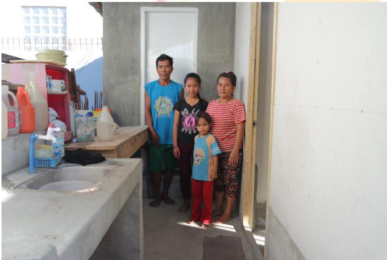
Lavatory and Restroom