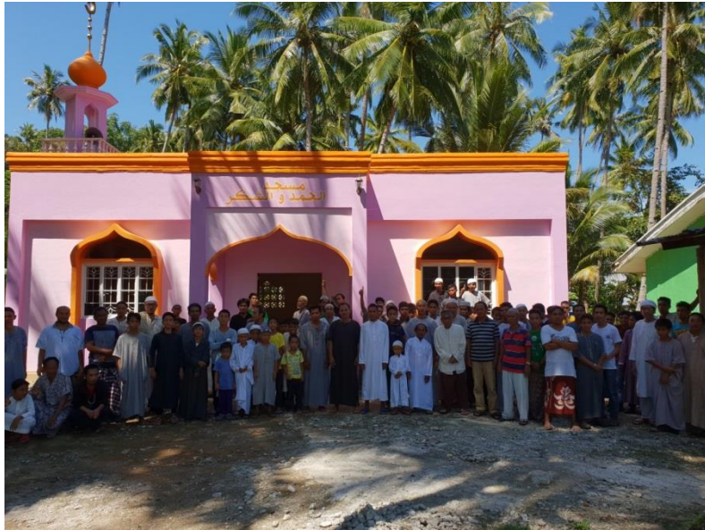
Fully furnished Masjid in Taguiti