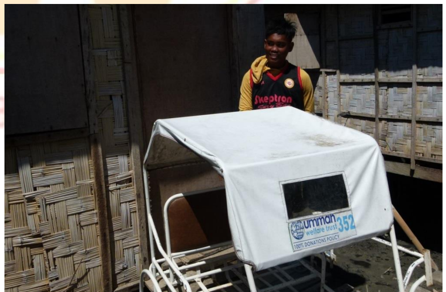
Trisikad beneficiary #352