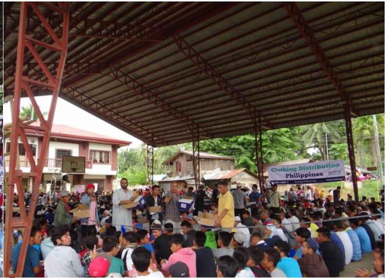
GWC 786 administration distributing clothes