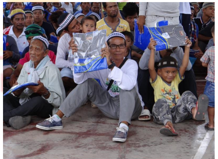
Very happy with their new Gamis