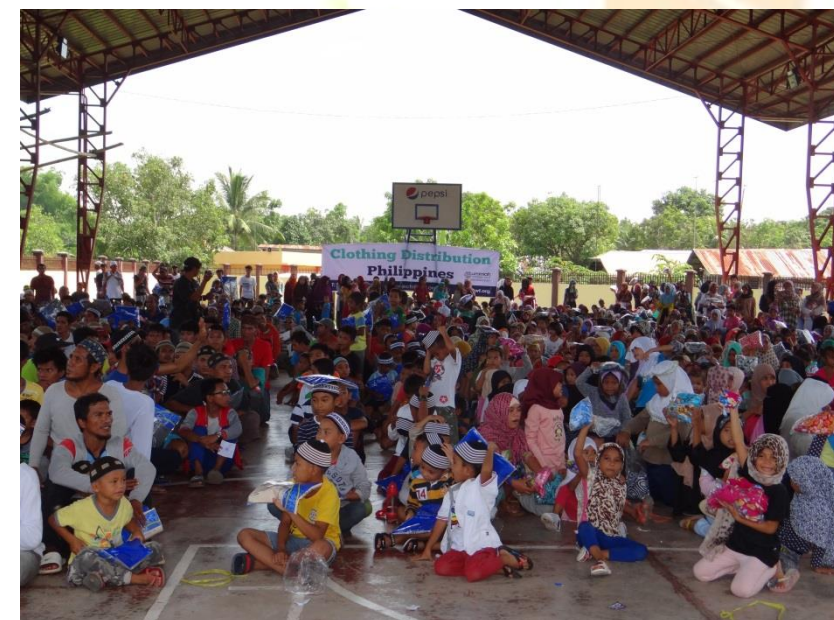
Children and Adults received their clothes