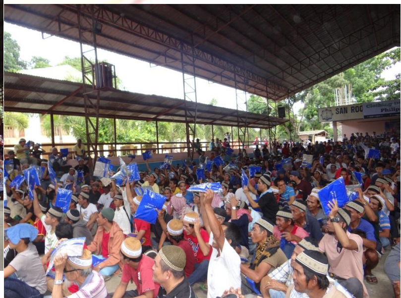
Male beneficiaries holding the gamis they received