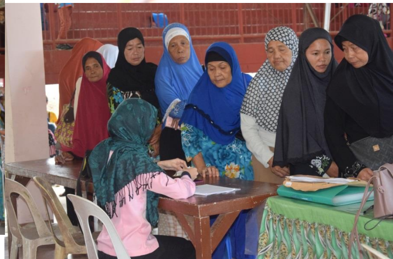
Signing documents and Identification