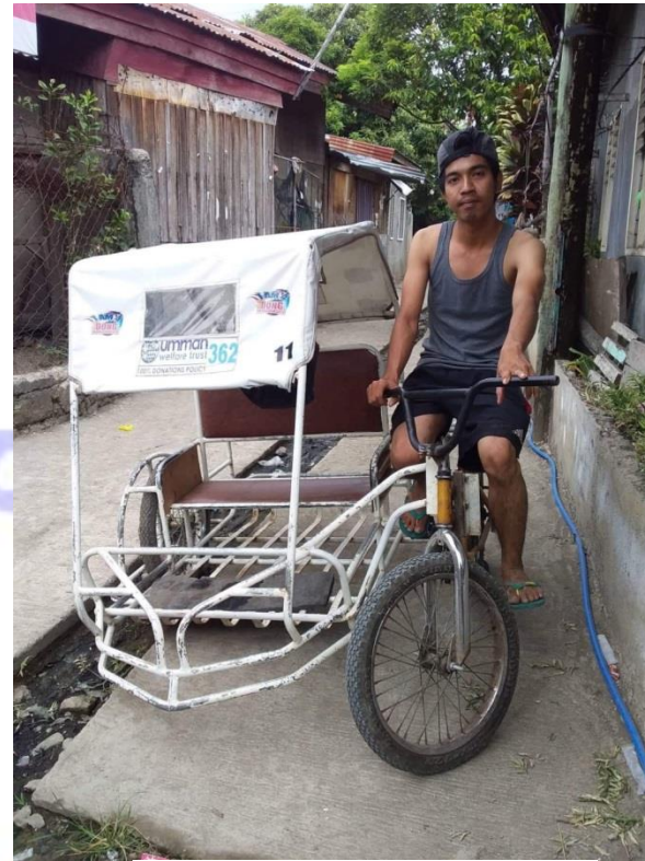
Trisikad beneficiary #362

Trisikad is a three-wheel vehicle that is used for transporting one person from one place to another but in a short distance only. This is one source of livelihood that is a common living in Zamboanga City. The income in this kind of job is small but at least we were able to help them feed their family in a good way. We have awarded trisikad to 25 beneficiaries with a total number of 150 family members. The total cost of this project was approximately PHP 300,000.00