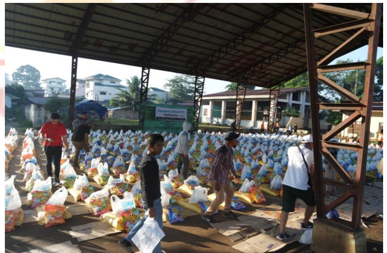
Laborers arranging packages