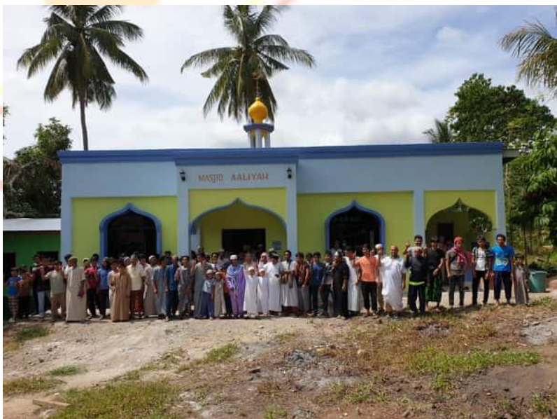
Fully constructed Masjid in Buenavista

spread love and Islam values. There are a total of 300 Muslims that will surely benefit this project who heartily thanks Goodwill 786 management for this mosque construction. The mosque was painted in Blue, sky blue and apple green. The total cost of this project was 1,100,000.00.