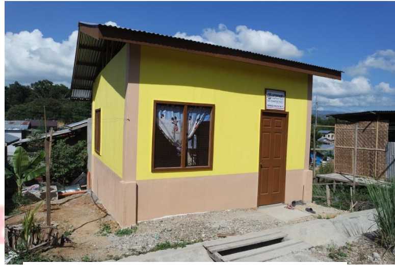
Fully Constructed House

These families are all unfortunate families where some are victims of fire disaster that was relocated in the said place. The turnover ceremony was held last January 18, 2019, attended by Homeowners Association officers, Barangay Officials, Goodwill 786 Administration, 35 beneficiaries and other guests. The beneficiaries felt overflowing joy during the ceremony as they were grateful for Goodwill 786 management who builds them a house where they can now stay comfortably and happily. The total cost of this project was approximately Php 3,519, 843.50.