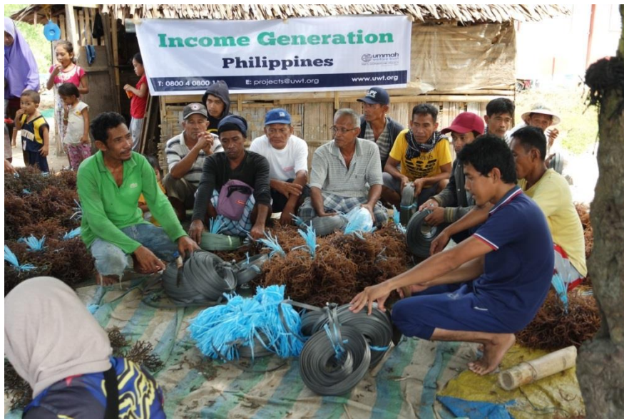
Seaweed farmers with their materials