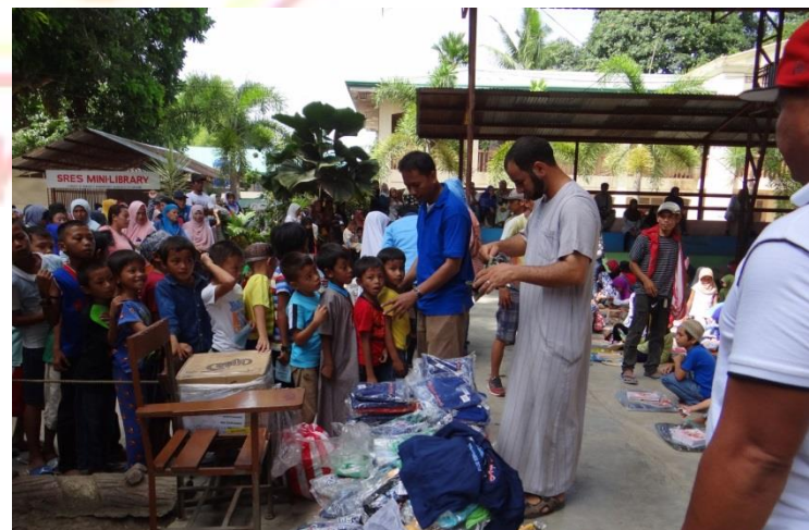
GWC 786 manager assisting during the distribution