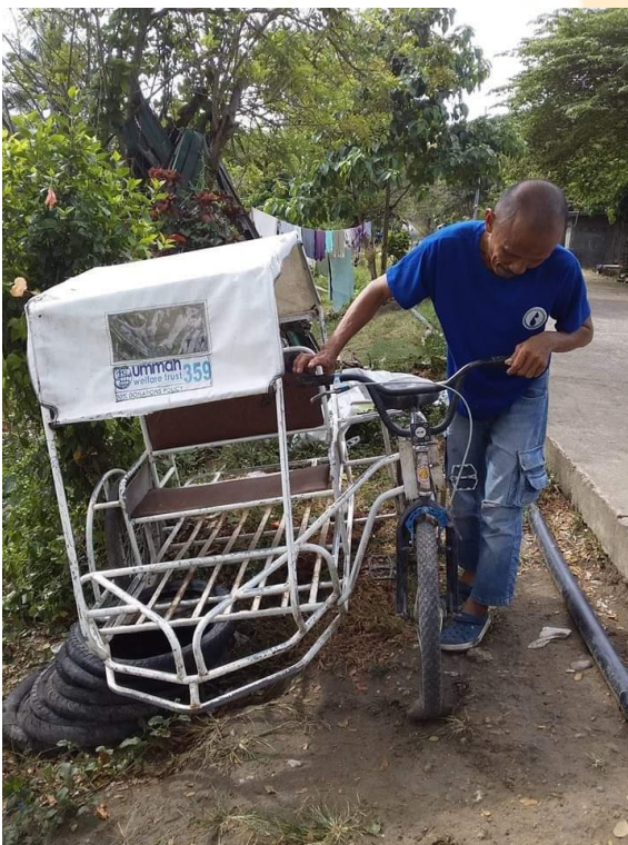
Trisikad beneficiary #359