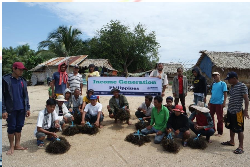
20 beneficiaries for seaweed farming