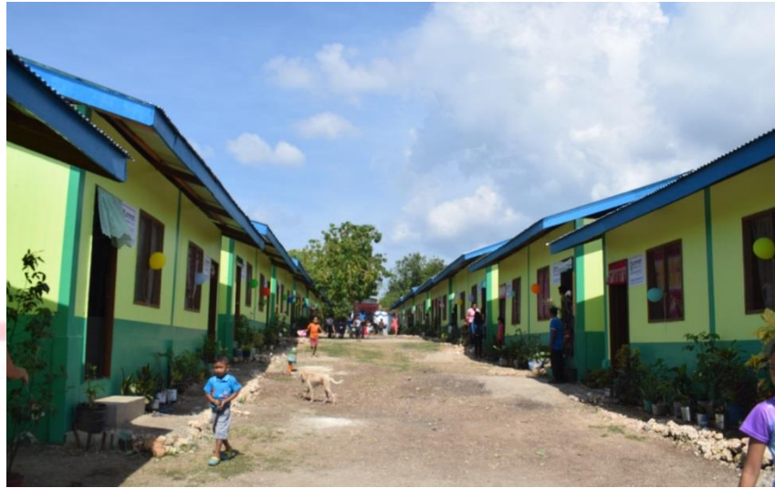
Newly built houses

All of them are Christian families who are homeless and don't have a good house to stay with for some are made of light materials only. They were built a new house with 2 bedrooms, a living room, and a restroom. The units/houses were painted in green and blue. This was a 5 months project that cost PHP 3, 368,817.00