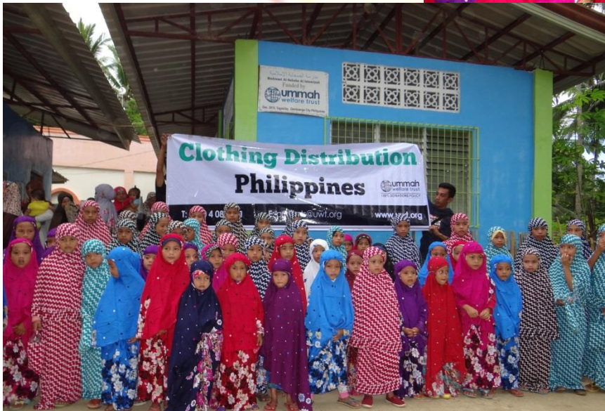
Children wearing the beautiful clothes they received