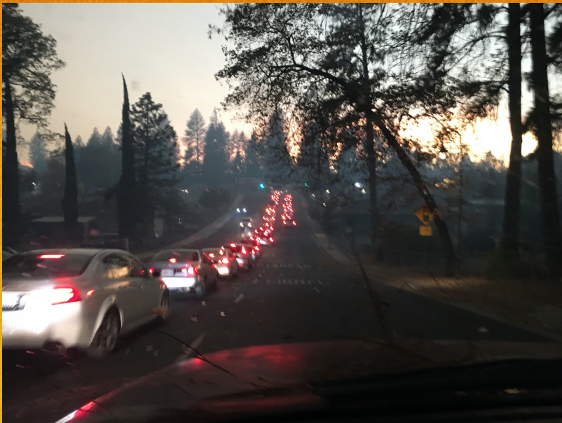
Camp Fire, November 8-25, 2018

What is the point we want you to understand here?