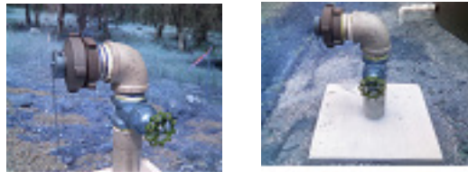
Example of hydrant/FDC and fittings

EXAMPLE OF RISER SUPPORT, OTHER METHODS MAY BE USED WITH APPROVAL.