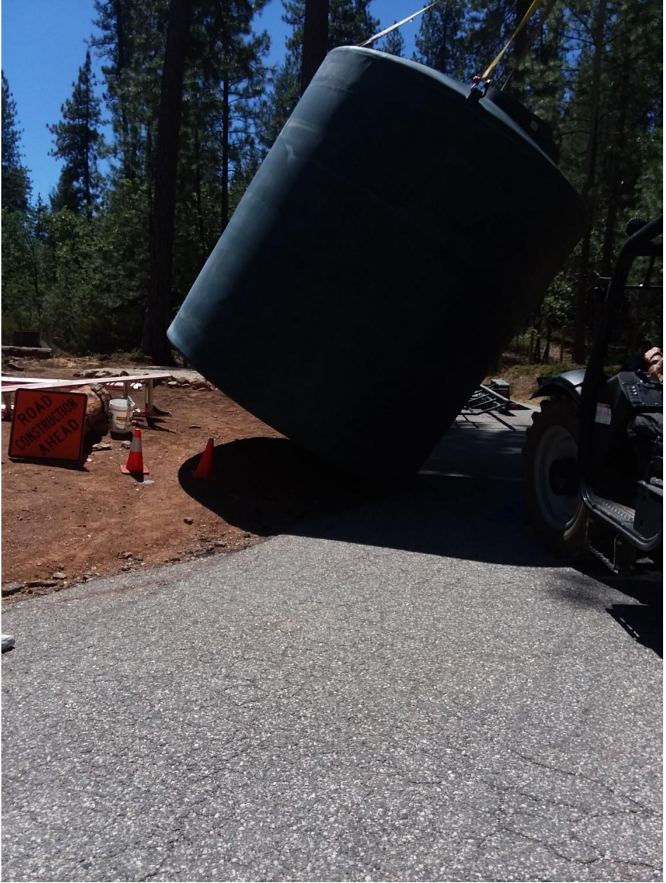
WATER TANK DELIVERY, MILE MARKER 4, GREENHORN ROAD, GRASS VALLEY, CA