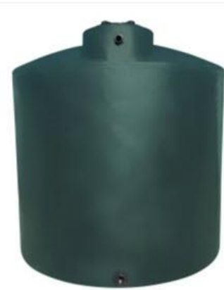
Conical shape preferred (10,000 gallons).