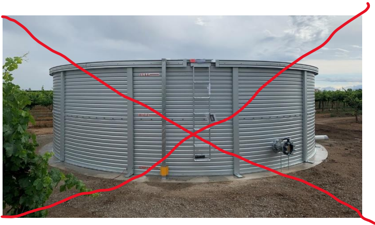
First consideration (20,000 gallons). After severe snow storm, determined flat top would not bear snow load.