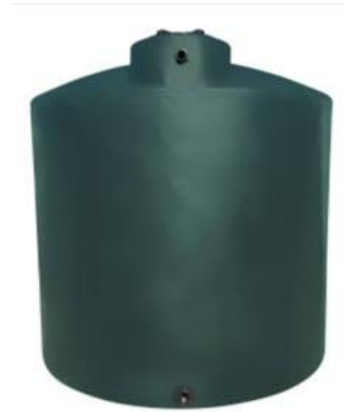
Conical shape preferred (10,000 gallons).