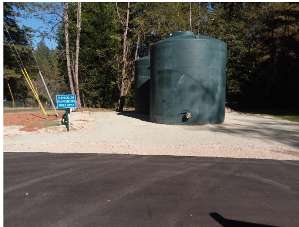
After clearing with water tanks installed