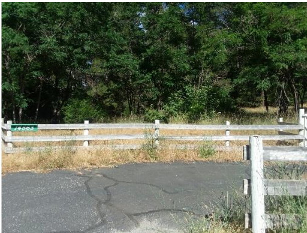
Designated easement area before clearing

It is our responsibility to fill the water tanks initially and to keep them full. When this water is used to fight fires, it the firefighting agency’s responsibility to replace the water they use. Work with your fire company to get the best price for the water.