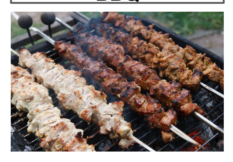
The most important part of it is Mediterranean style.

Also immigrant brought their traditional dishes that become part of modern cuisine