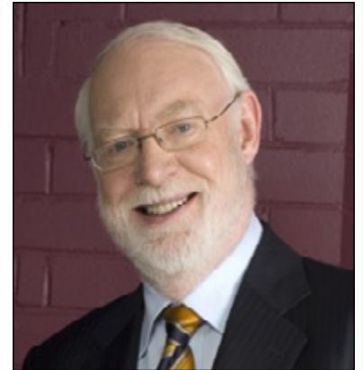
Our Patron, David Stratton AM

Misbehaviour , UK/France, 2020, Com/Drama/History, 106 min, 6.2 on IMDb. M (with Studio Canal)