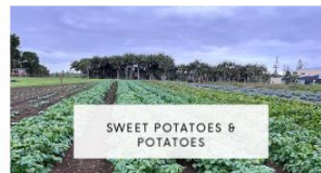
SWEET POTATOES & POTATOES