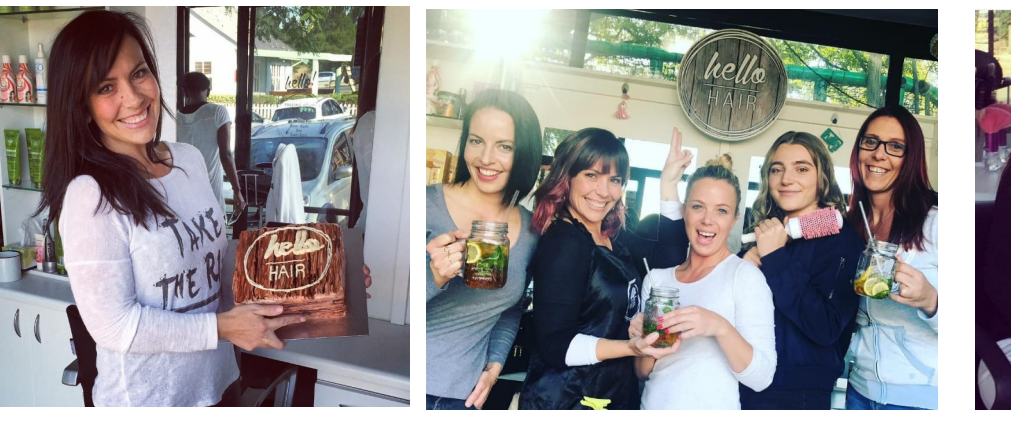
Hello Hair's 1st Birthday

On 22nd of May 2015 Hello Hair opened to the public . Five years later, thousands of people have sat in her chairs, many staff members have come and gone through her doors, but what has remained consistent, are her loyal customers; the love and care that my team and I put into them, and the intention to create that safe space, that home-away-from-home.