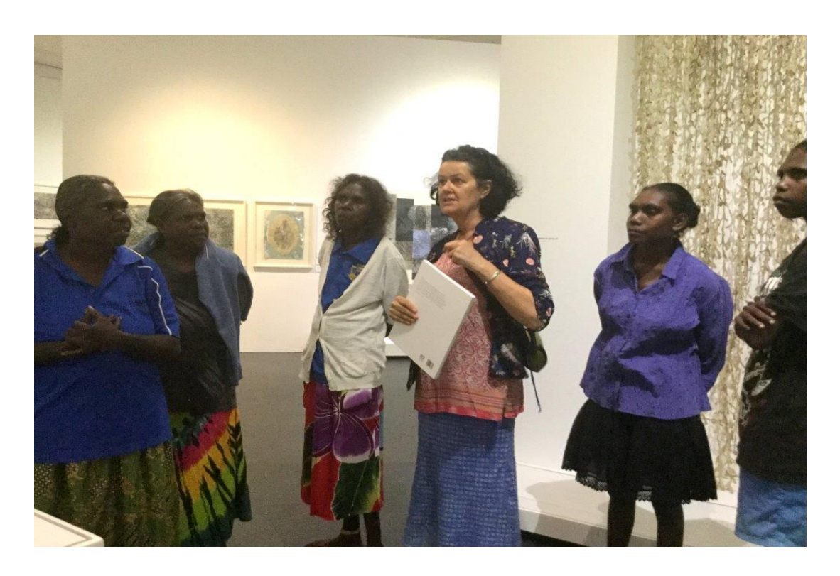
Knucky Centre women visit Winsome Jobling exhibition at the NT Museum